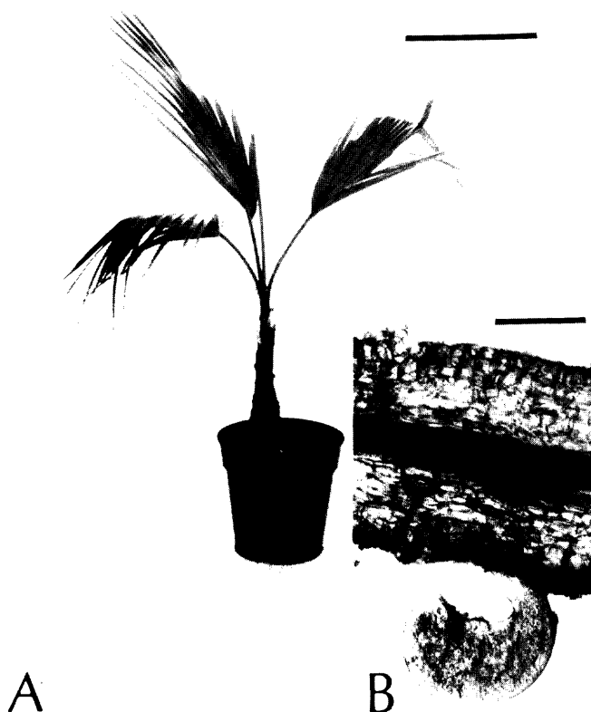
Fig. 1. Washingtonia robusta infected by Rotylenchulus reniformis . Scale bars = 26 cm in A and 135 \mu m in B. A) Infected plant in pot. Note absence of aboveground symptoms. B) Nematode swollen female (N) with the posterior portion of the body protruding from the surface of a root.

INTRODUCTION: The reniform nematode ( Rotylenchulus reniformis Linford and Oliveira) occurs commonly in southern Florida, where it damages vegetable and field crops (7). Yield losses of 10% are reported in infested fields of snap bean and squash in this part of the state (7). In Florida, the reniform nematode has regulatory importance, especially in the ornamental industry, because ornamental stocks contaminated with R. reniformis are rejected by Arizona and California with serious adverse economic impact for the Florida growers. Ornamental palms are grown intensively in southern Florida (Dade County) due to the favorable environmental conditions that exist in this part of the state for the production of these plants. Ornamental palms are particularly subject to the indirect damage caused by the reniform nematode because they are often grown in soil infested with this pest. For regulatory purposes, palms contaminated with reniform nematodes are considered infected regardless of their host status to the nematode. Recent host-range studies conducted by the Division of Plant Industry and the University of Florida using nine ornamental palms and one cycad have indicated that the most common palms grown in Florida are not hosts of the reniform nematode (5). In those tests, only the Washingtonia robusta palm was found infected by R. reniformis which did not induce obvious aboveground symptoms on this host (Fig. 1) (5).